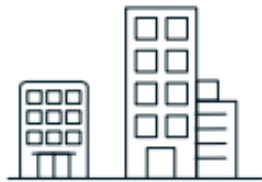
Total Family Offices

30% of Multi Family Offices across the globe consider allocating directly