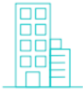
Multi Family Offices

83% of Single Family Offices worldwide consider allocating directly